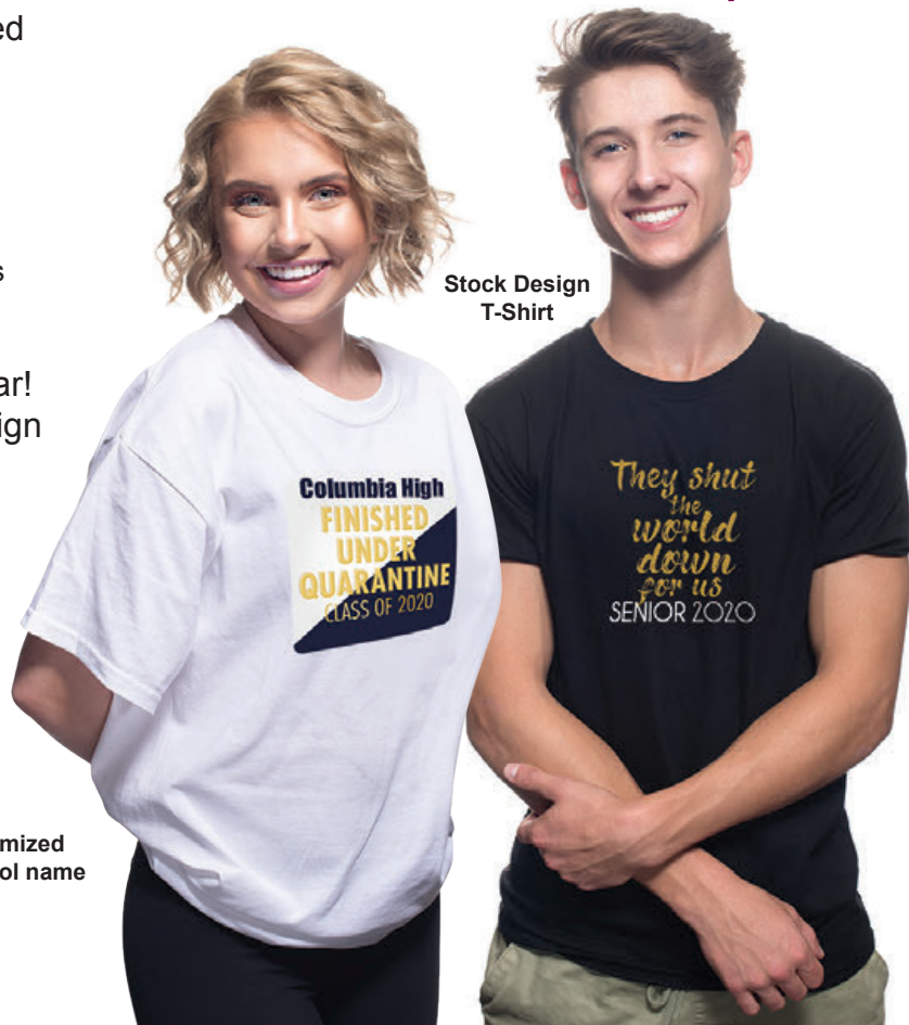
Stock Design T-Shirt

Visit Andersons.com for complete T-Shirt information.